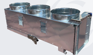
SHK - Fork Lift Dump Bin