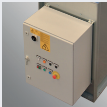
UL Labeled Control Panel / Starter