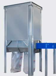
Optional panels for enclosed version - Outdoor unit